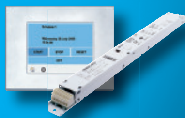
Lichtsteuersysteme für DALI Anwendungen